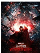
Doctor Strange in the Multiverse of Madness