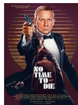
No Time to Die