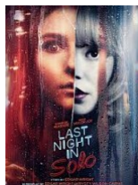
Last Night in Soho