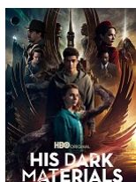
His Dark Materials