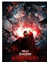
Doctor Strange in the Multiverse of Madness