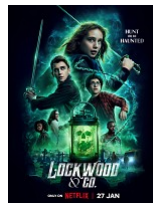
Lockwood & Co