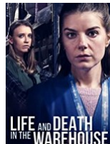
Life & Death in the Warehouse