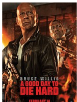
A Good Day To Die Hard