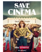
Save the Cinema