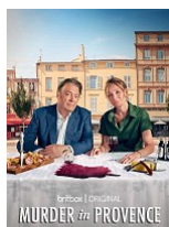
Murder in Provence