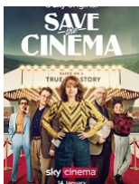
Save the Cinema