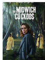
The Midwich Cuckoos