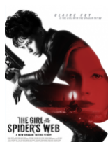
Dragon Tattoo: The Girl in the Spider's Web