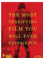
Evil Dead (2013)