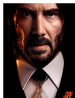
John Wick: Chapter 4