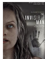
The Invisible Man