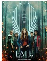
Fate: The Winx Saga