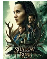
Shadow and Bone