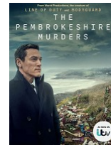
The Pembroke Murders