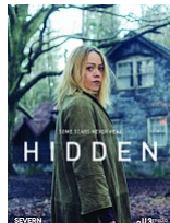
Craith / Hidden