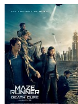
Maze Runner: The Death Cure