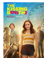
The Kissing Booth 2