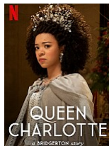
Queen Charlotte: A Bridgerton Story