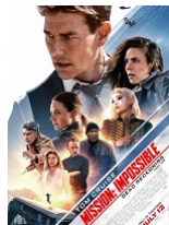
Mission: Impossible - Dead Reckoning Part One