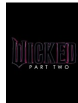
Wicked: Part Two