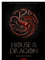
House of the Dragon