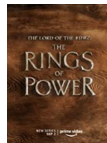
The Lord of the Rings: The Rings of Power