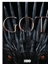
Game of Thrones