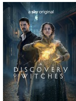
A Discovery of Witches