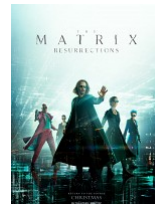
The Matrix Resurrections