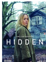
Craith / Hidden