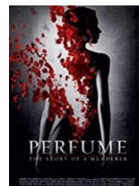
Perfume: The Story of a Murderer