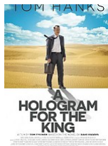
A Hologram for the King