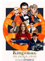
Kingsman: The Golden Circle