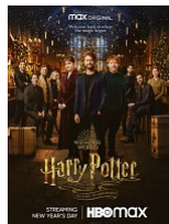
Harry Potter 20th Anniversary: Return to Hogwarts