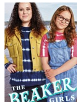
The Beaker Girls