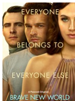
Brave New World