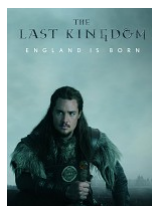
The Last Kingdom