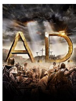
A.D. The Bible Continues