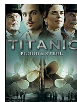
Titanic: Blood and Steel