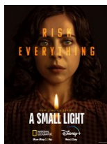
A Small Light