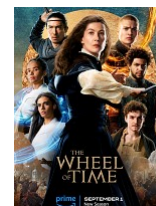
Wheel of Time