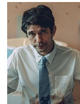
This Is Going to Hurt