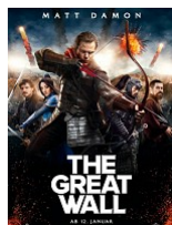
The Great Wall