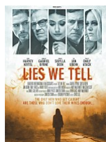
Lies We Tell