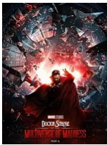
Doctor Strange in the Multiverse of Madness