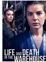
Life & Death in the Warehouse