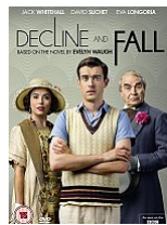
Decline and Fall