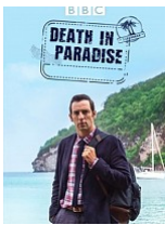
Death in Paradise