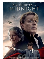
Six Minutes to Midnight