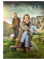
Presence of Love