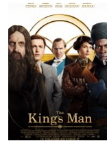
The King's Man