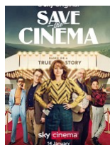
Save the Cinema