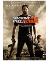
Machine Gun Preacher