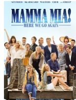
Mamma Mia! Here We Go Again