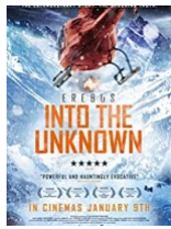
Erebus: Into the Unknown