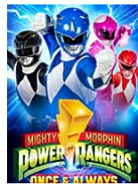
Mighty Morphin Power Rangers: Once and Always