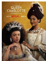
Queen Charlotte: A Bridgerton Story