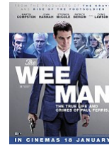
The Wee Man