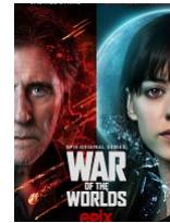
War of the Worlds