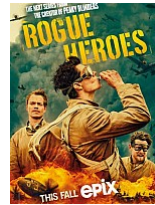
SAS: Rogue Heroes