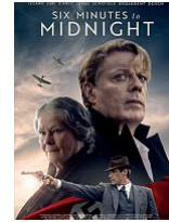
Six Minutes to Midnight