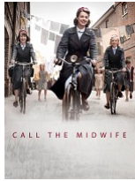
Call the Midwife