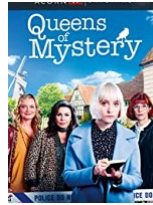
Queens of Mystery