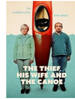
The Thief, His Wife and The Canoe