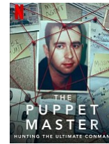
The Puppet Master: Hunting the Ultimate Conman