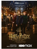
Harry Potter 20th Anniversary: Return to Hogwarts