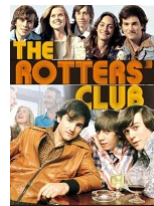
The Rotters' Club