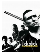
Lock, Stock and Two Smoking Barrels