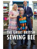
The Great British Sewing Bee