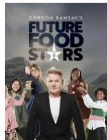
Future Food Stars