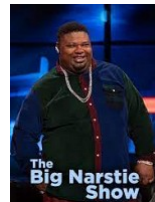
The Big Narstie Show